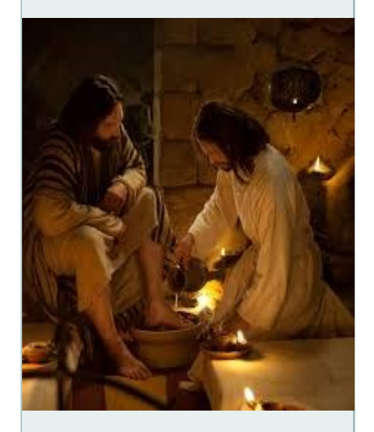
"Do this in memory of me" is a command and call to action. Do we dare to live our lives following the example of Christ?